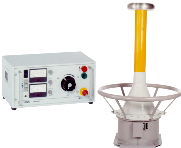
The figure is illustrative.